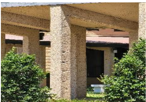
Picture: Courtyard pillar damage