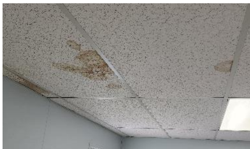
Picture: Roof leak over meeting room 211