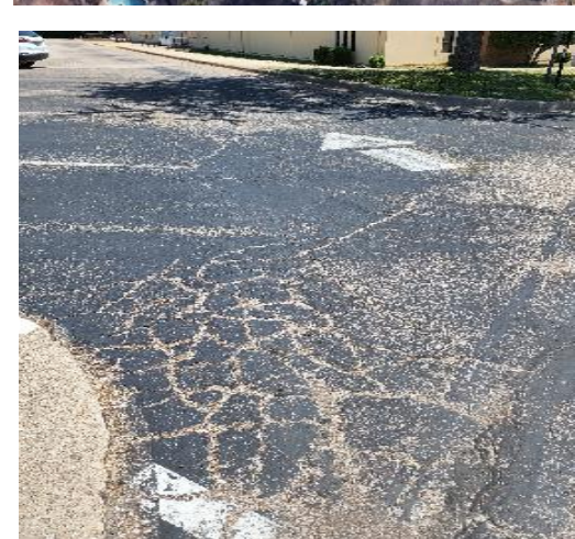
Picture: Parking lot wear and damage