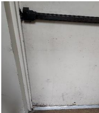
Picture: Damaged kitchen door