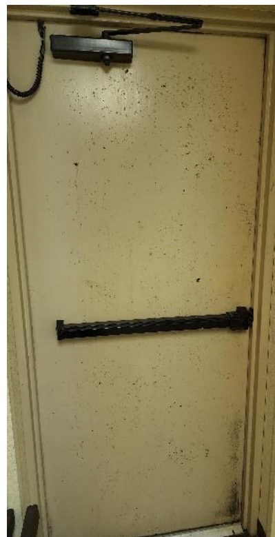
Picture: Rusted Parish Center back door